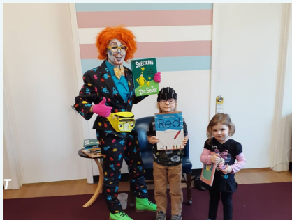
DRAG STORY TIME RETURNING IN SUMMER 2021