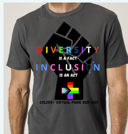
VIRTUAL PRIDE 5K RUN/1 MILE WALK TSHIRT JUNE-JULY 2021